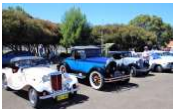
A couple of old favourites—Q. What is the model of the white one?