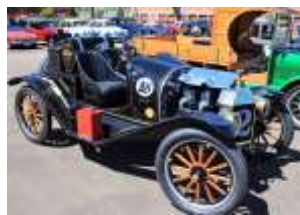
Is this really a Morris in disguise?