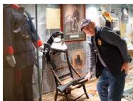
Westley and Richards Monkey Tail Carbine is added to the Samuel White Reedbeds Cavalry Colonial Display