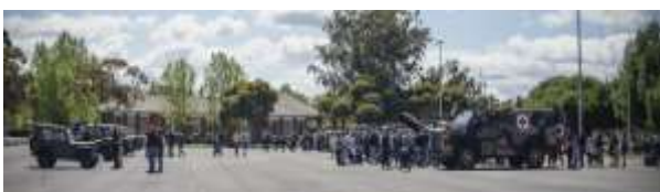
Keswick Barracks Parade Ground—crowd scene