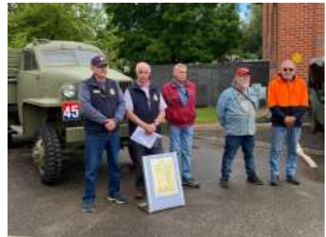
The team of volunteers who worked on the Studebaker Restoration Project.