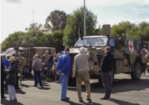
Bushmaster from 7 RAR Edinburgh