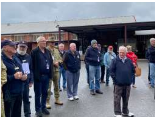
Volunteers assemble for the official launch of the restoration of the Studebaker after 3 years of effort sometimes interrupted by COVID restrictions.