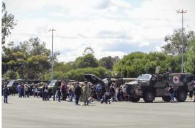
Vehicles and weapon systems deployed on the parade ground at Keswick