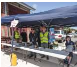
Museum volunteers serving food