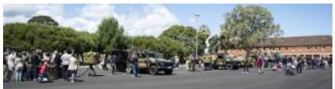
Vehicles on the Parade Ground