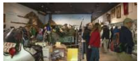
Visitors to the Museum during the Open Day—scene in the main gallery of the Museum