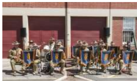
10/27 RSAR Band performing for the crowd