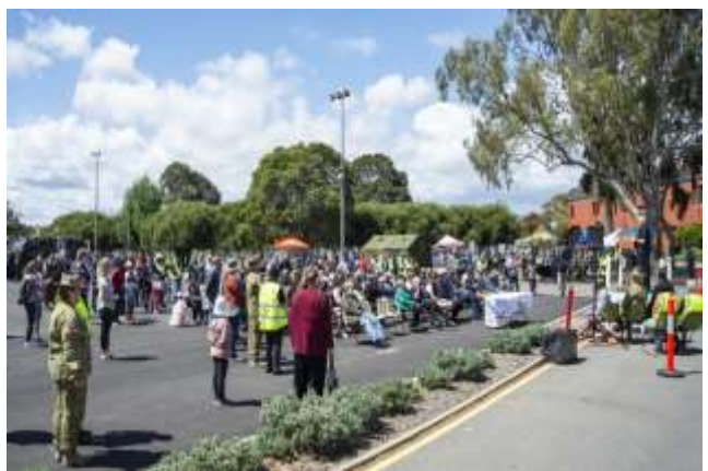
Crowd assembling for the birthday celebrations and cake cutting