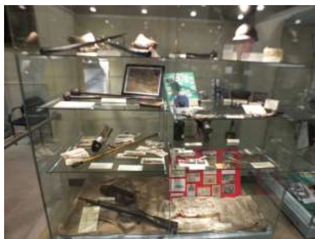
Tascho cabinet—adjustable shelves, lighting and security of display items